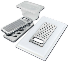
Grating kit complete with ring support and food collection tray